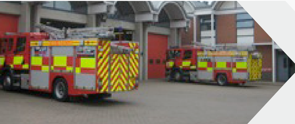
Greys Fire Station

Comments: "The heating system use to run 365 days a year/ 24 hours a day even throughout the summer just to heat the drying room. Heating bills have been reduced and the station is now a lot cooler in the summer especially in the dormitory next to the drying room".